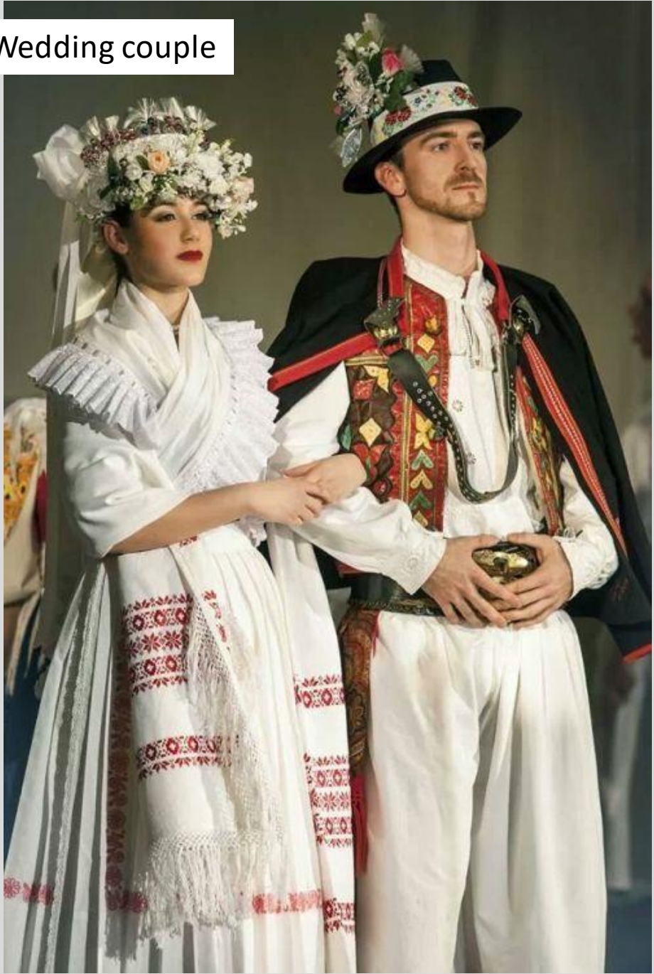
Partizan, Slovakia - Wedding couple