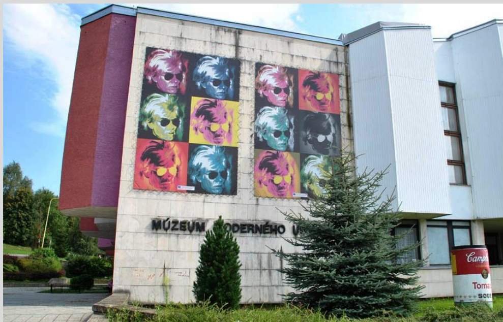
The Andy Warhol museum